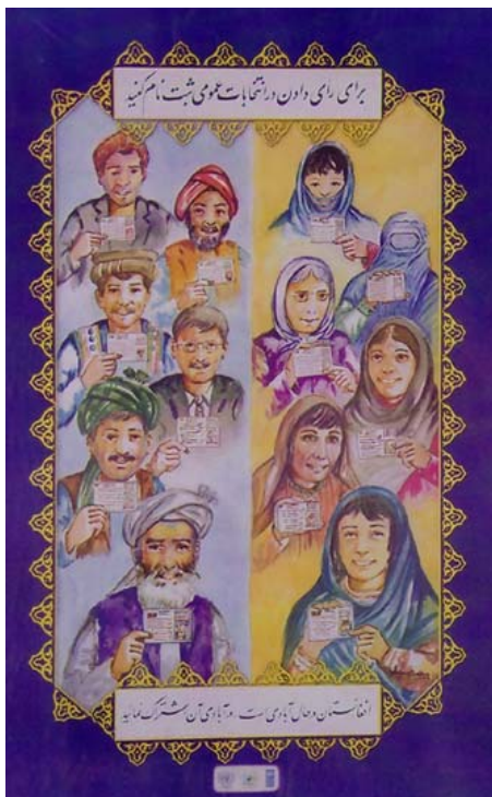
“To vote in the election is everyone’s affair,” reads this voter education poster

post-conflict election with international and domestic observers for the campaign period, vote and count. This has been the strategy used in post-conflict elections in Cambodia, South Africa, East Timor, Haiti, Bosnia, Mozambique and Namibia, and for many other elections held in fragile political environments where enhancing trust was at a premium.