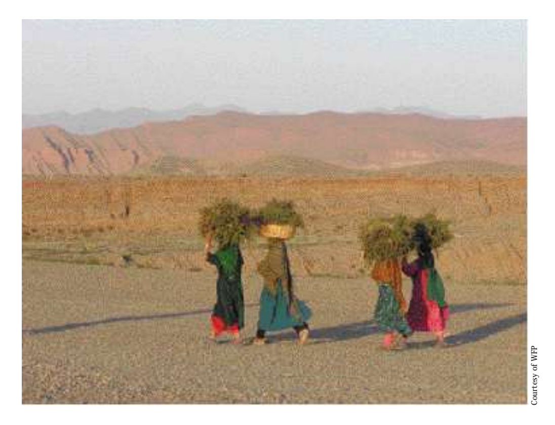
Land is now on the agenda, but action is slow to get underway

Studies conducted by the Afghanistan Research and Evaluation Unit (AREU) since 2002<sup>1</sup> consistently demonstrate that landed property issues in Afghanistan are deeply intertwined with both continuing instability and slow recovery and reconstruction, and need to be tackled in direct ways to contribute to lasting peace and progress. Recognition of this has grown within the Transitional Administration and assistance community. Whereas land issues failed to be mentioned in the Tokyo Ministerial Meeting of January 2002, land matters were very much on the